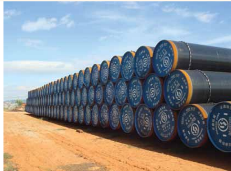
宝钢UOE焊管成功应用于西气东输二线工程