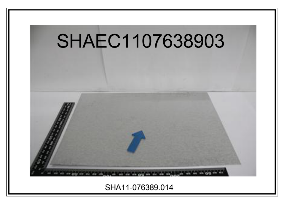
SGS authenticate the photo on original report only